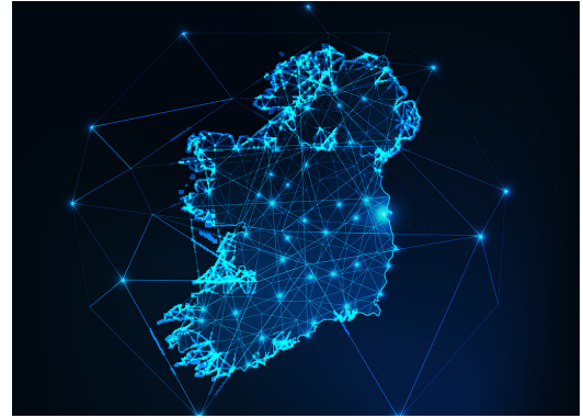
We offer an all-Ireland Service

We are a large indigenous Irish accounting firm. Founded in 1970, we are based in the heart of Cork's traditional business district in our landmark, offices on the South Mall, and on the doorstep of the IFSC in Dublin. Generations of graduates are now Chartered Accountants having trained with Moore.