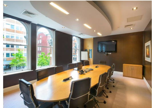
Our state of the art office facilities

Today Moore is a top Irish accounting and advisory firm with over 130 employees in Cork and Dublin, and regionally around the County of Cork. With strong coverage of Ireland's main commercial centres, we are uniquely placed to offer an all-Ireland service, all driven from Cork.