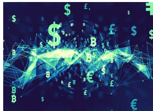
We are emerging specialists in advising on digital assets