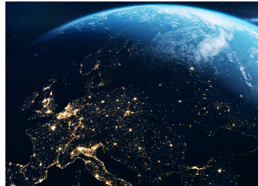
Specialists in assisting multinational enterprises working in Ireland

To illustrate this diversity, we are leaders in our field in advising credit unions. But we are emerging leaders in the rapidly growing, cryptocurrency and blockchain sectors in Ireland. We keep moving. We keep changing. We do this as the world does not stand still.